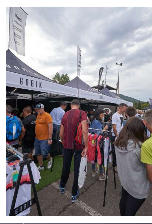
Espacio Premium Ibero